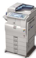
Aficio® MP C2051/MP C2551