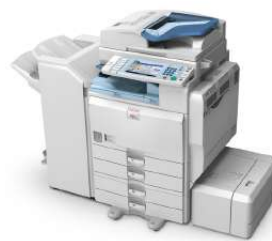
Aficio MP 2851/3351/4001/5001