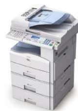
Aficio MP 171/MP 201F/MP 201SPF