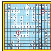
Example 1A: The first player could start JACKET and ARM by covering the first letter of each word...