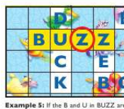
Example 5: If the B and U in BUZZ are covered, and the Z in ZEBRA is already covered, complete BUZZ by covering the first Z—then collect a scoring chip!

See the folded sheet for Advanced Game rules.