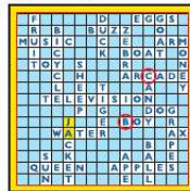
Example 2A: The second player could start CANDY and BOY by covering the first letter of each word...