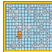
Example 1B: ...but decides to cover both the J and the A in JACKET, instead.