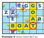
Example 4: If you cover the T to complete BOAT and GOAT, collect two scoring chips!