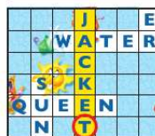
Example 3: If you cover the T to complete WATER, collect one scoring chip.